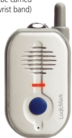
Transmitter showing speaker phone

If the center can not contact the caller or determine whether an actual emergency exists, they will notify emergency providers to go to the caller's home, monitoring the situation until the problem is resolved.